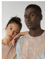
Creator Tie and Dye